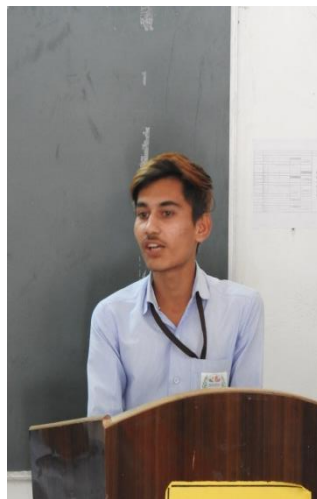
Feedback by Student B.Sc.II yr