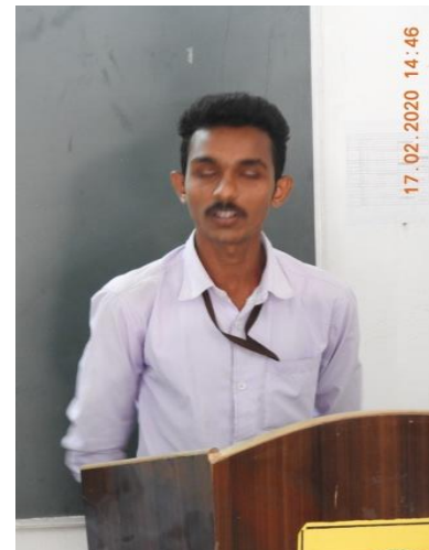
Feedback by Student B.Sc.I yr