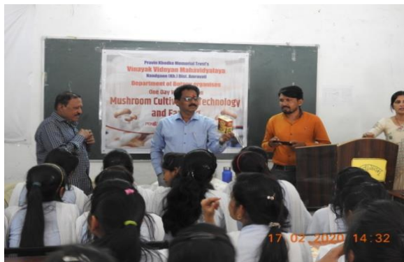
Guest showing Mushroom products