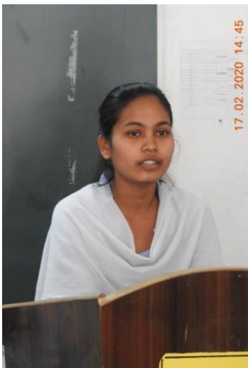
Feedback by Student B.Sc.III yr