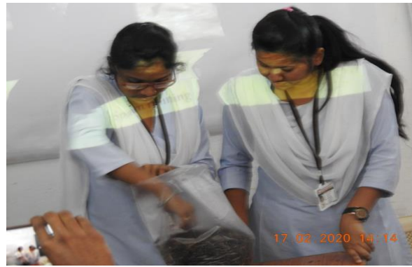
Students performing practical on Mushroom culture